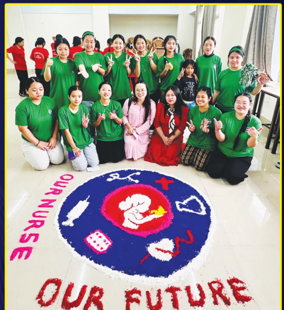
NURSES DAY CELEBRATION 2025