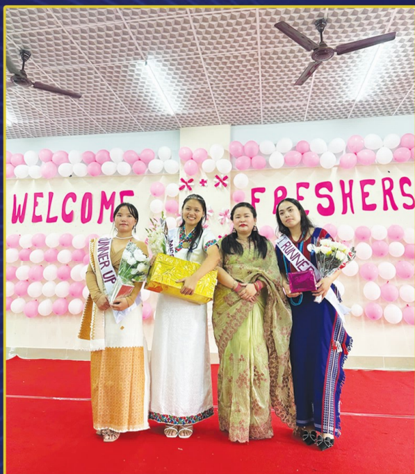
FRESHERS DAY CELEBRATION