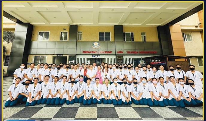
GNM 1 ST YEAR (BATCH 2024-25)