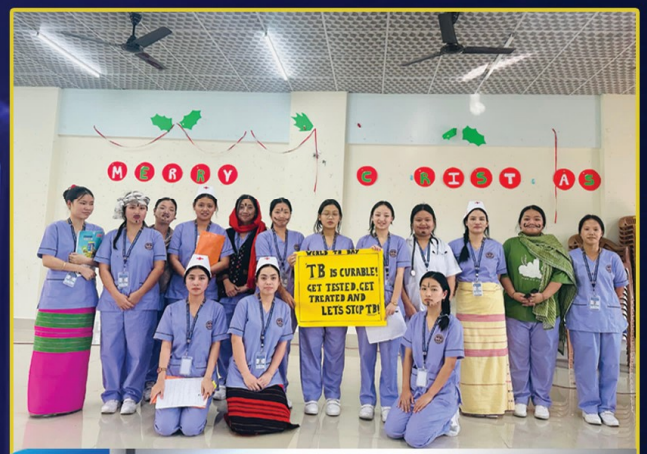
WORLD TB DAY CELEBRATION