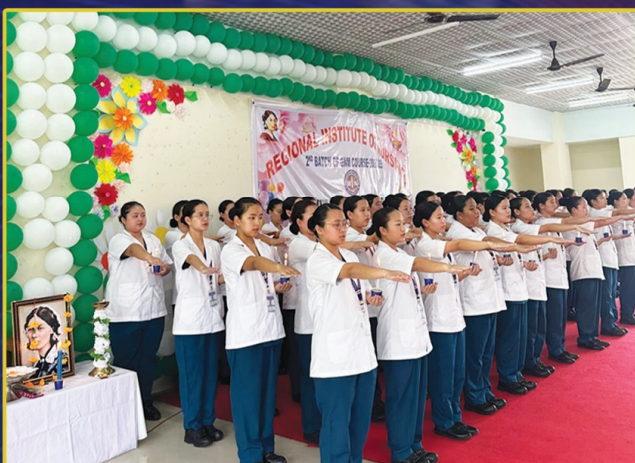
Lamp Lighting and Oath taking Ceremony