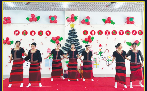
CHRISTMAS CELEBRATION 2025